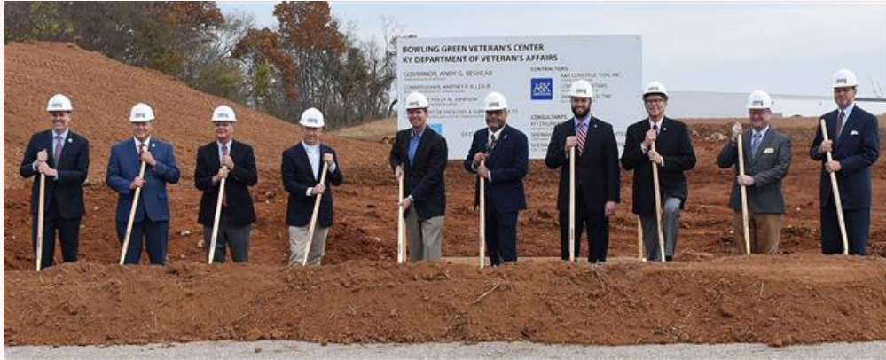
The Groundbreaking Ceremony for the future site of the Bowling Green Veterans Center was held November 2, 2022. Expected to open in 2024.