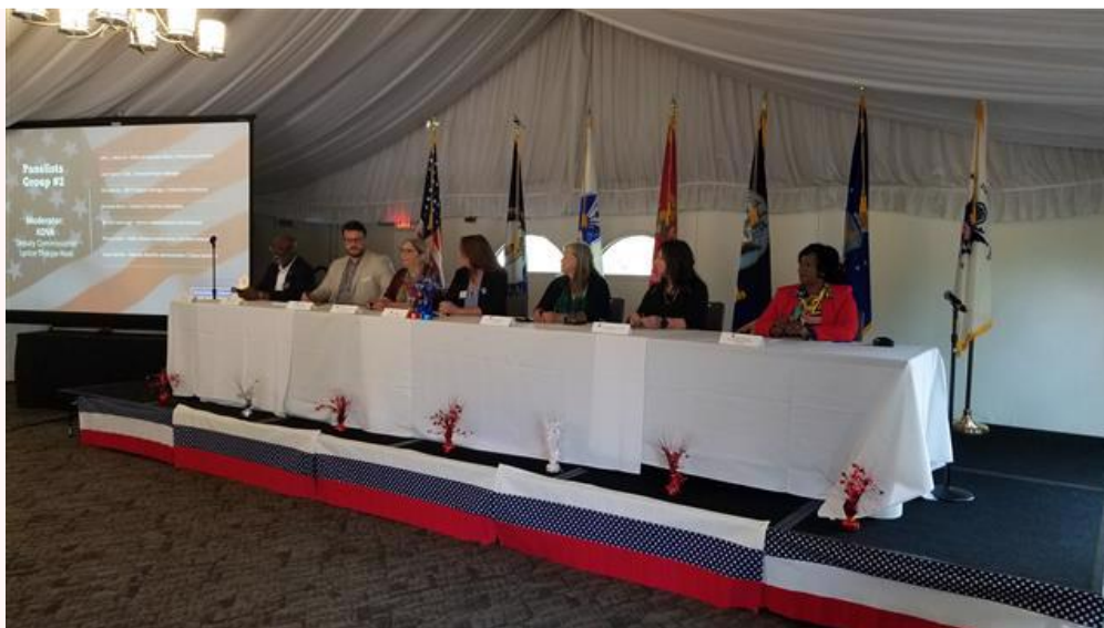
KDVA's Kentucky Women Veterans Conference, Veteran Community Panel, June 3, 2022.