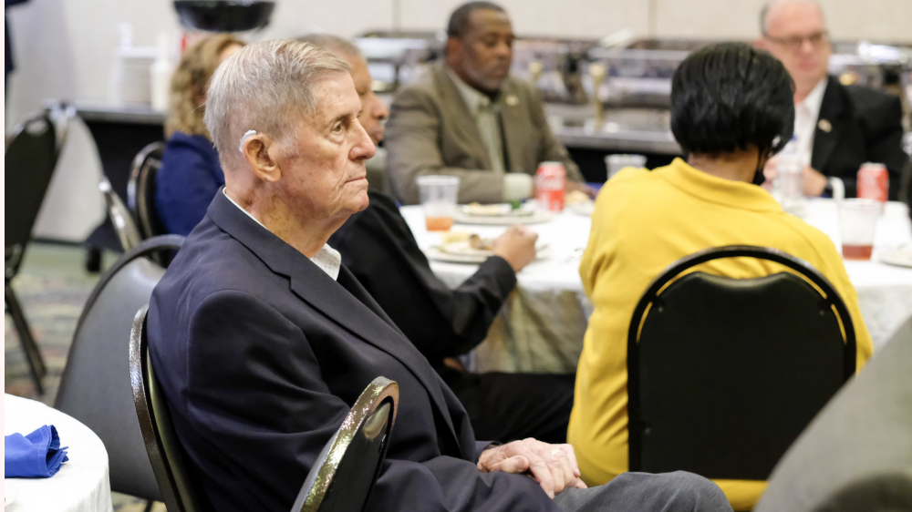
KDVA State Conference Aug. 22, 2022.